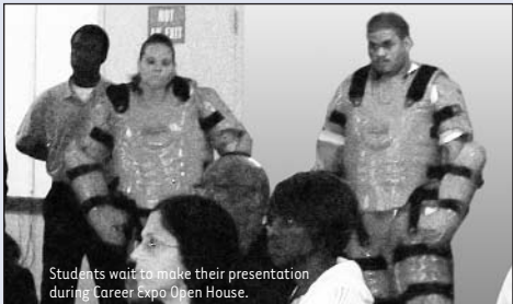
Students wait to make their presentation during Career Expo Open House.

Sep. 30: GJCC celebrated 45 years of "Building Lives and